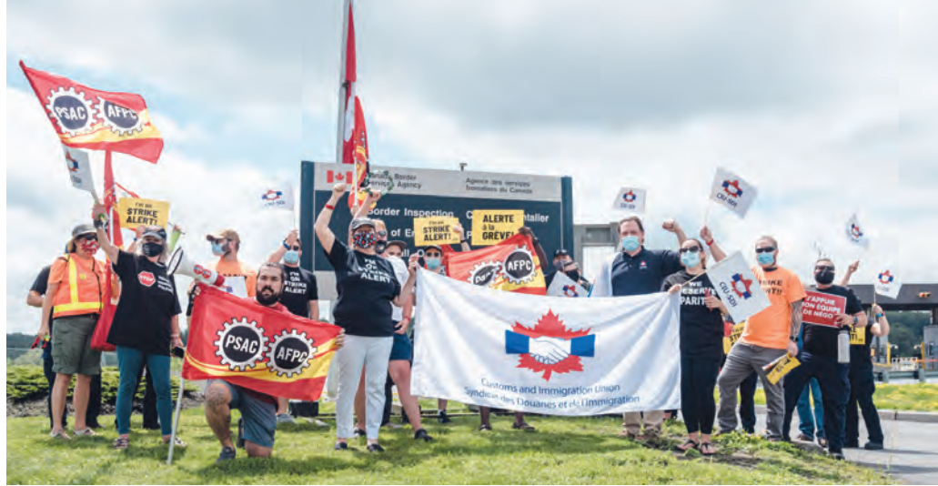
FB members attend an information picket in Cornwall, Ontario.

We also achieved significant improvements in our collective agreements. Many units adopted measures to fight sexual violence and harassment, such as paid domestic violence leave and protection plans with guaranteed anonymity. Many units also adopted leave for traditional Indigenous practices. Last but not least, many groups updated their collective agreements to ensure inclusive language.