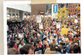
1991 National General Strike support demo Ottawa

PSAC members hold the largest national strike by a single union in Canada, gaining major improvements in job security.