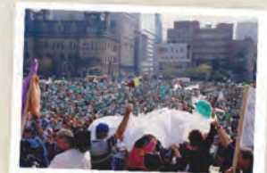
Pay equity demonstration mobilization on Parliament Hill, 1998

PSAC wins a landmark pay equity victory for more than 230,000 current and former members in women-dominated positions who received retroactive salary adjustments and interest totaling over $3.6 billion.