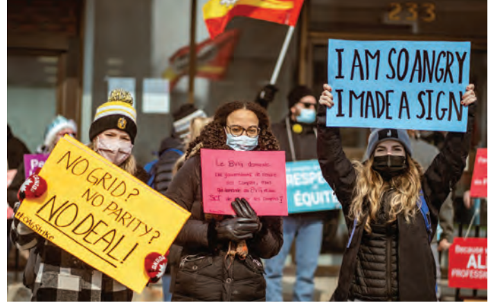
Office of the Auditor General strike

When thousands of PSAC members take to the streets as part of a rally against the Phoenix pay system or cuts to public services, people take notice. Having a mobilized and engaged membership is critical to getting the best possible deal at the bargaining table – for all our members. The biggest victories happen when members’ needs are reflected by their bargaining teams, and they in turn support their team and work together to mobilize.